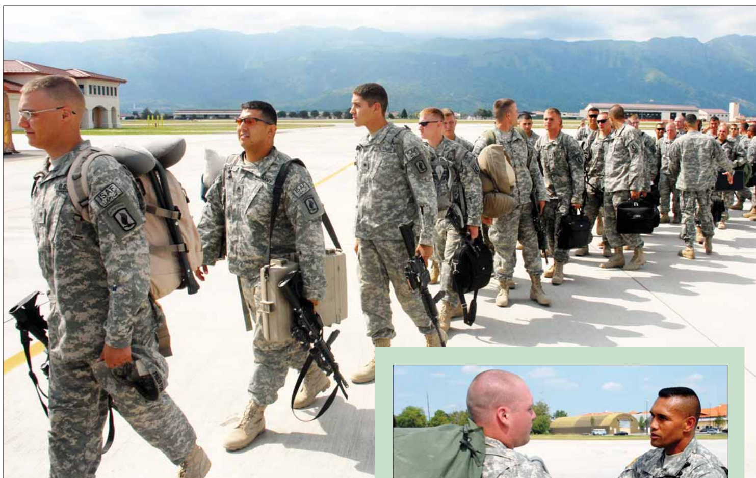
Soldiers from 1st Battalion, 503rd Infantry Regiment (Airborne) arrive Saturday at Aviano Air Base ending 14-month deployment to Afghanistan.

Below: Ready to get home, the Soldiers board the buses that will take them back to Caserma Ederle, where their spouses, family and friends are waiting to greet them.